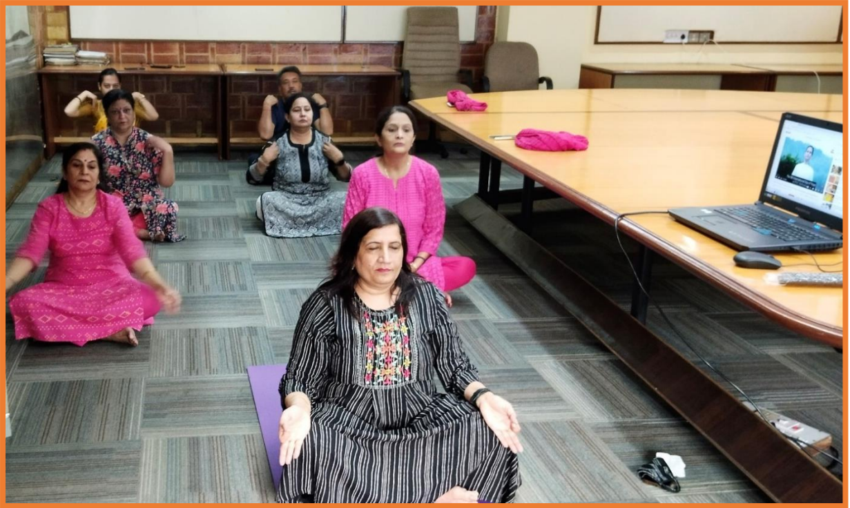
Celebrating Yoga Day 21.06.2022