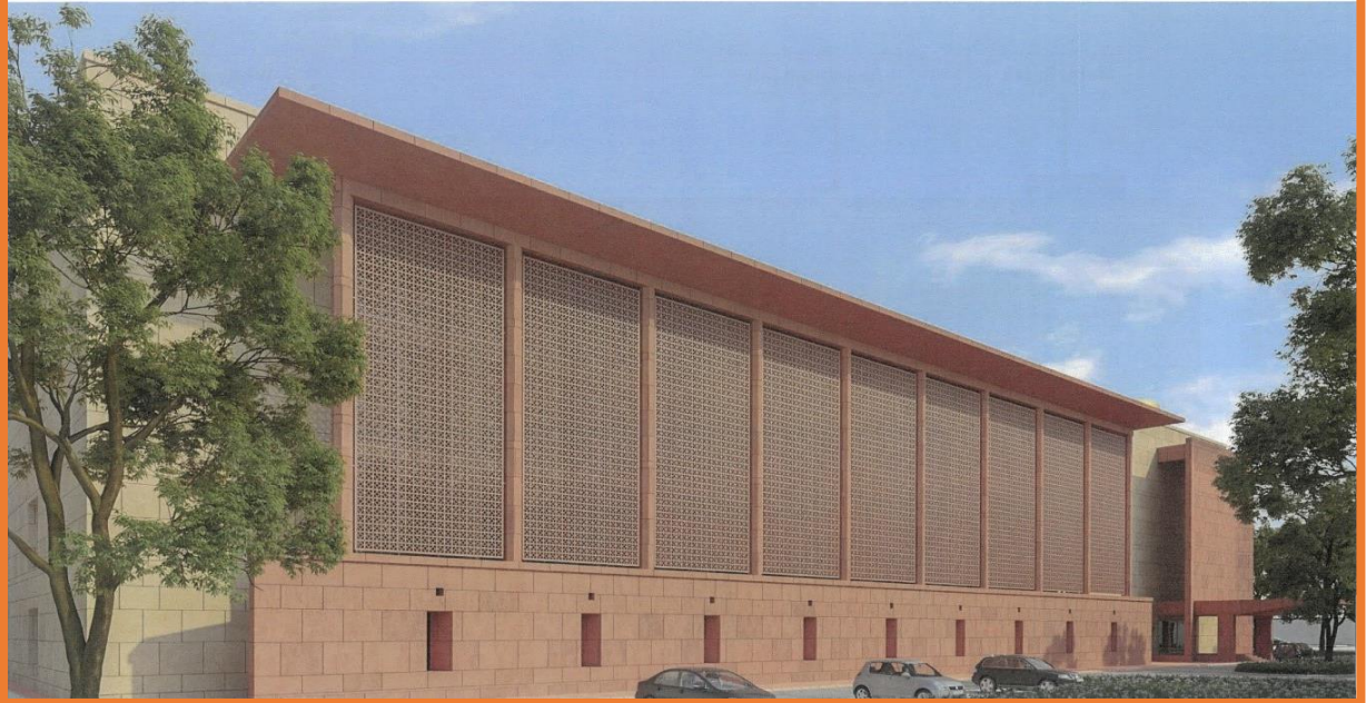
Building Exterior Views

The recommendations of the Commission were in respect of zero discharge, rain water harvesting, camouflaging of services, architectural elements etc.