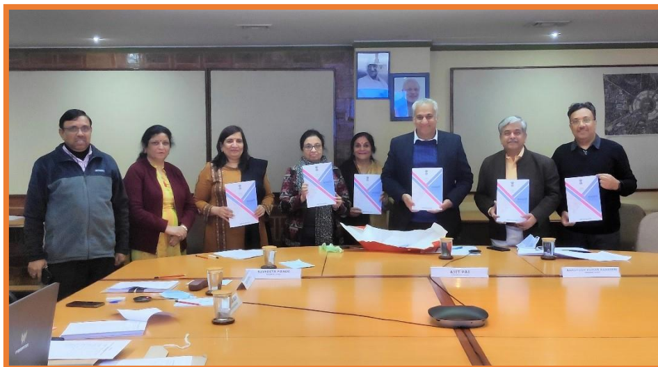
Launching new issue of Kalakriti

The Commission had till the year 2011-12 been maintaining its Annual Accounts on accrual basis except for salary. As per advice of Audit, the salary component is also now being maintained on accrual basis from the year 2012-13.